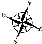
SECOND FLOOR (ceiling = 7' 9")