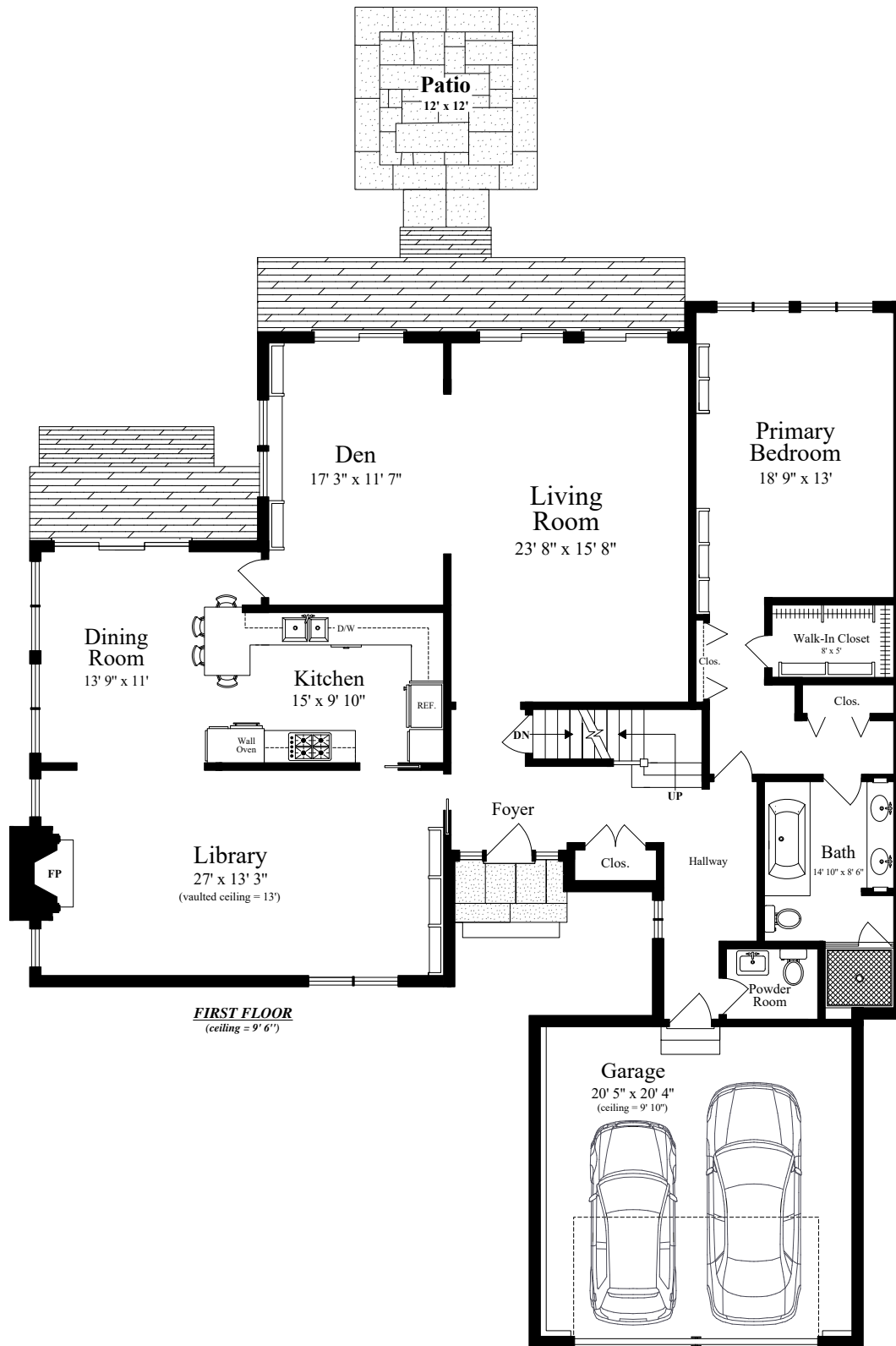
FIRST FLOOR (ceiling = 9' 6")