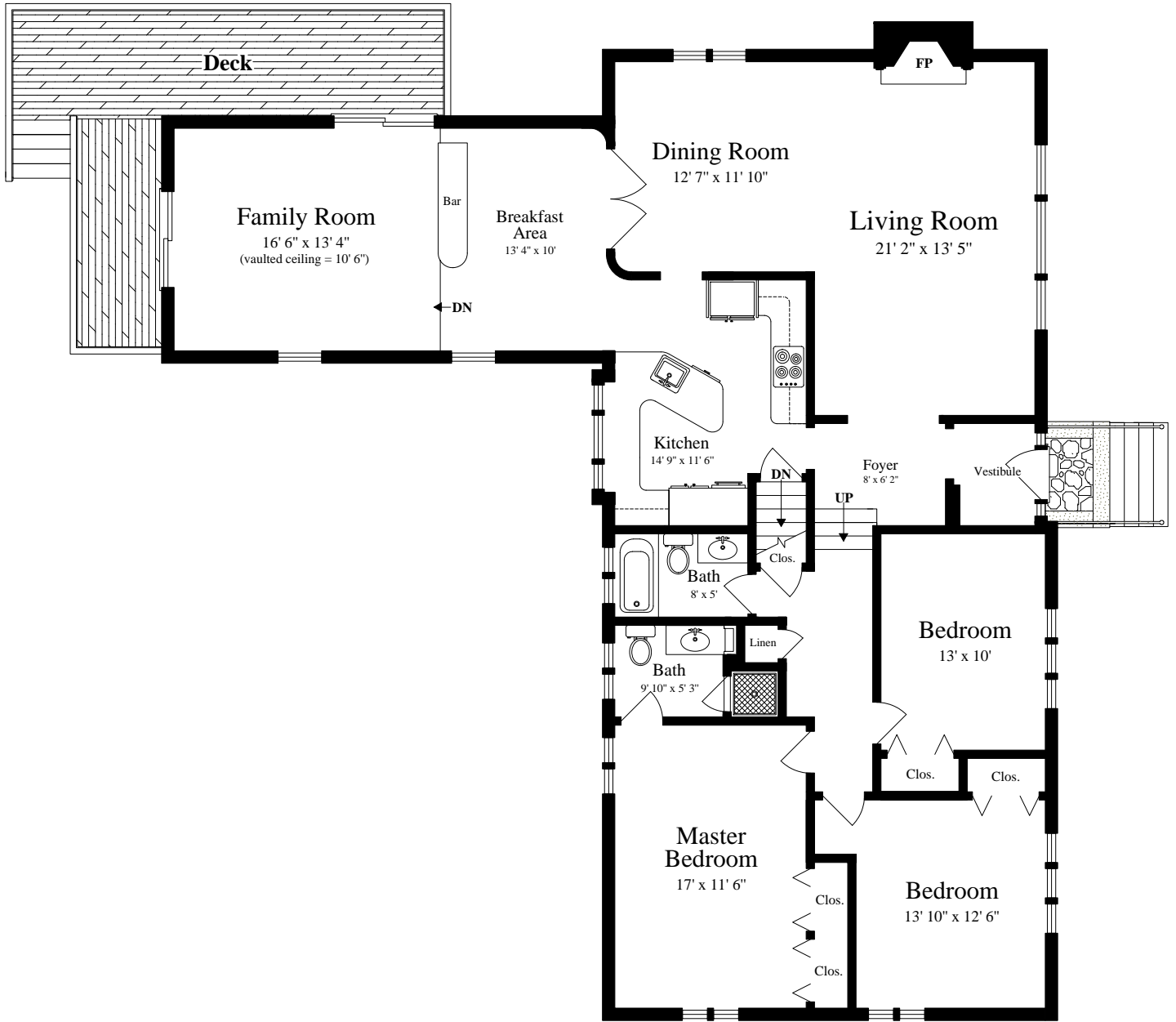
UPPER LEVELS (ceiling = 7' 10")