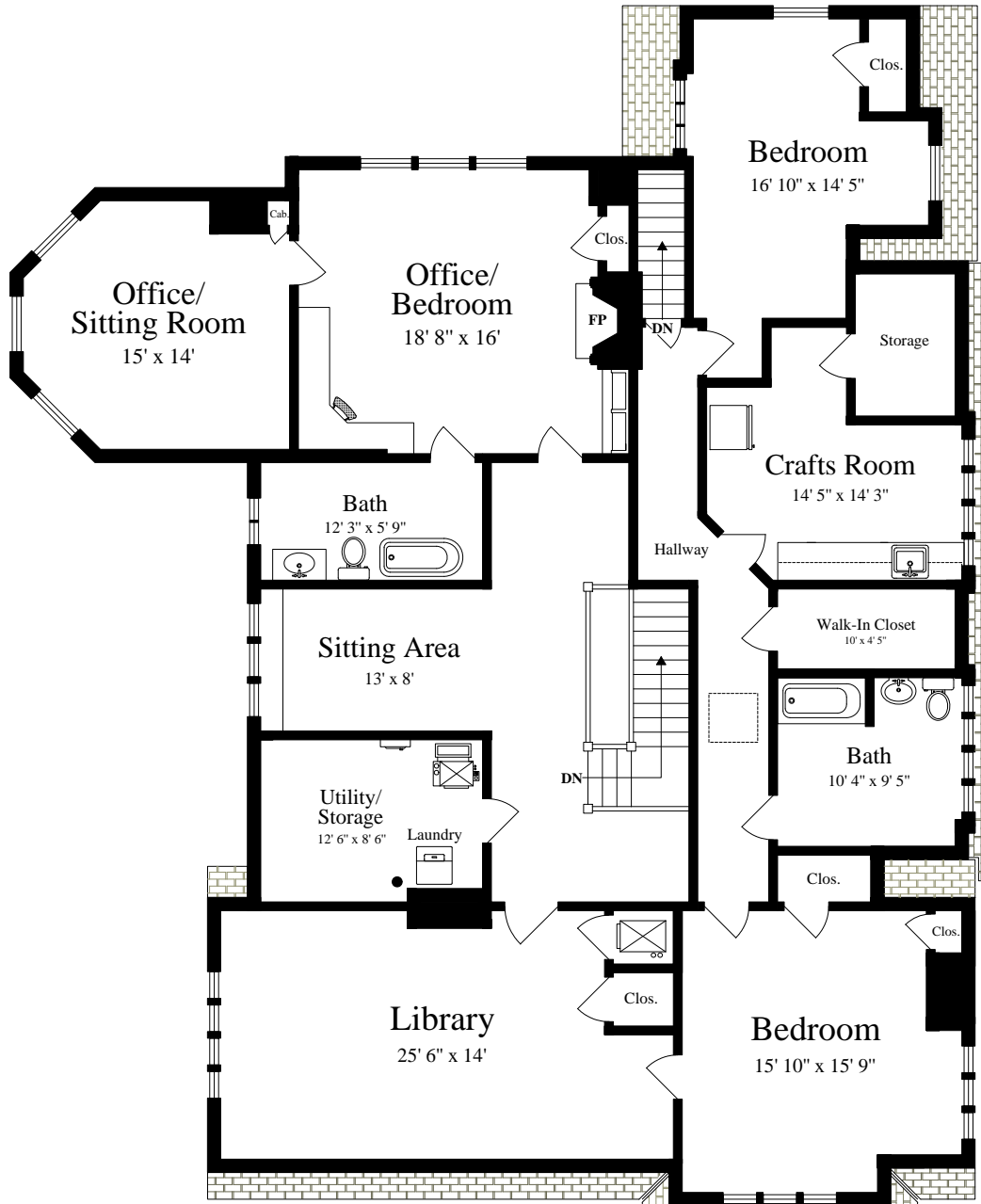
THIRD FLOOR (ceiling = 9' 7")