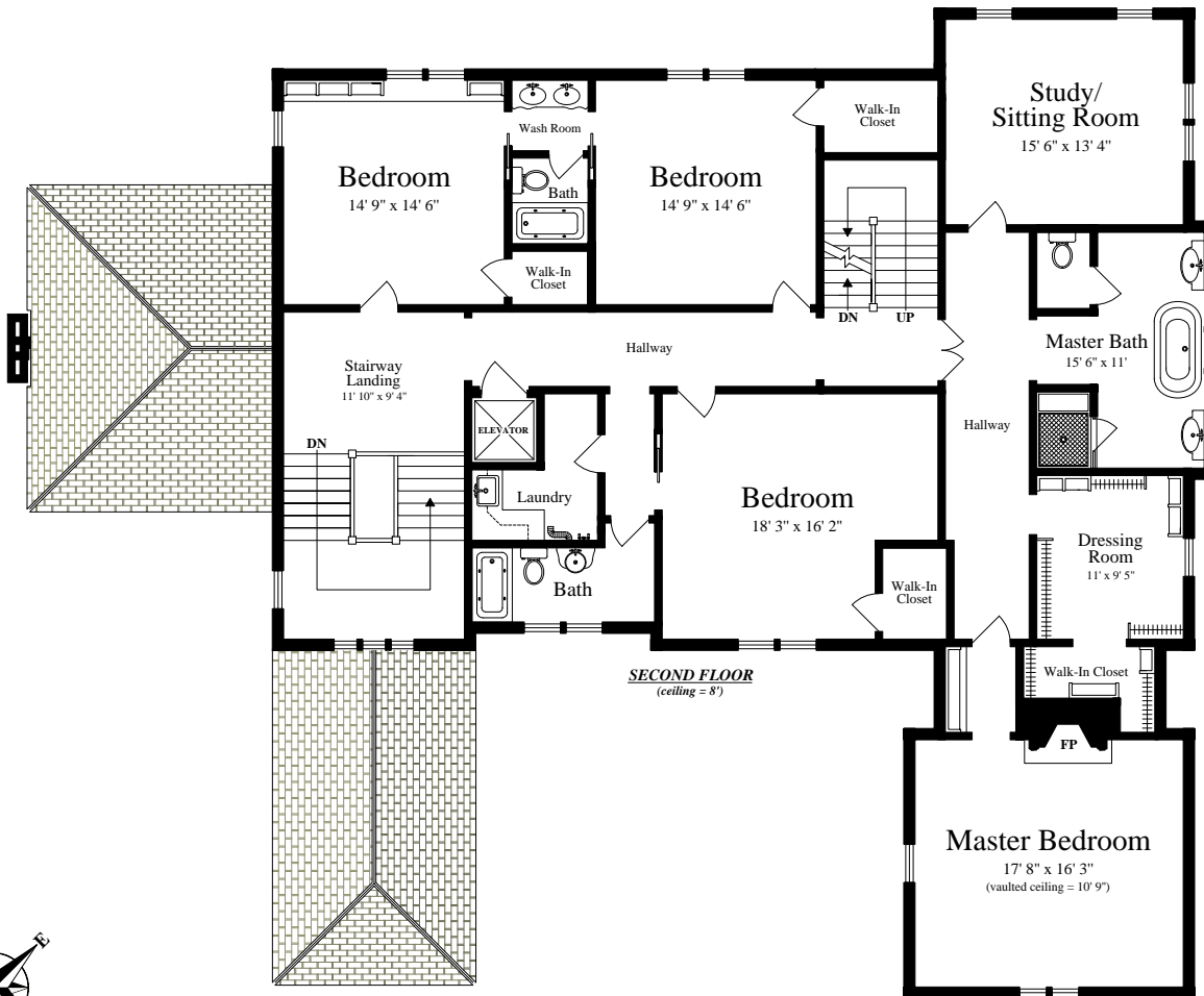
SECOND FLOOR (ceiling = 8')