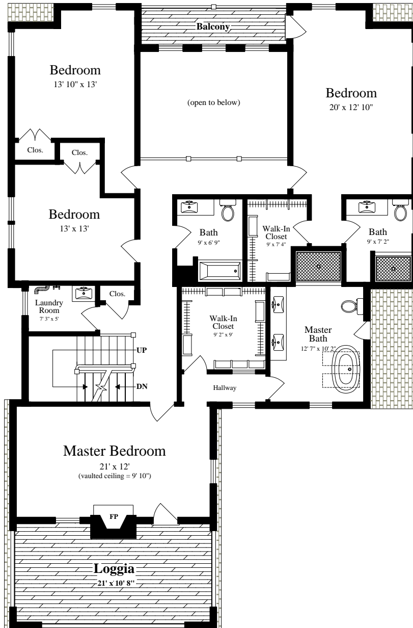
SECOND FLOOR (ceiling = 9')